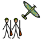
Royal Air Force (RAF)