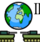
World War II